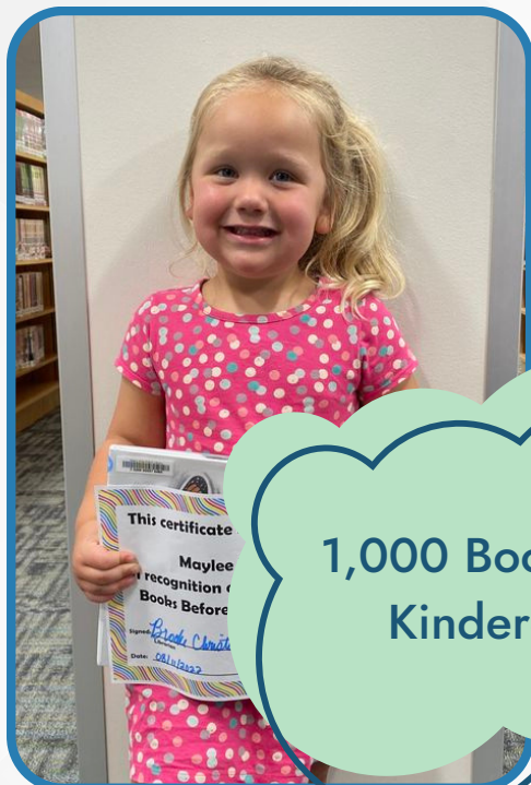
1,000 Books Before Kindergarten