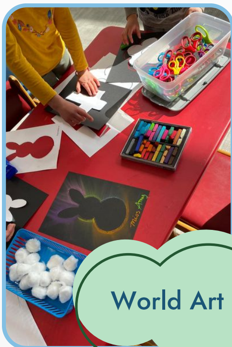
World Art Day